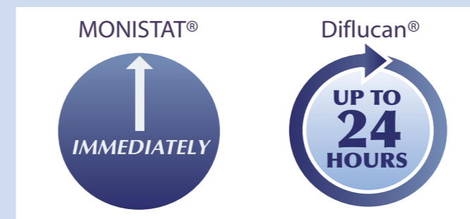
Time to Onset of Symptom Relief